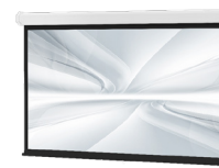
Matte White surface