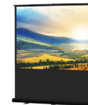
Matte White surface