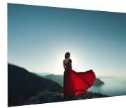
HD Progressive surfaces