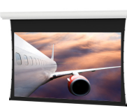
HD Progressive surfaces