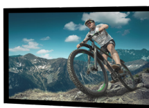
HD Progressive surfaces