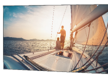
HD Progressive surfaces