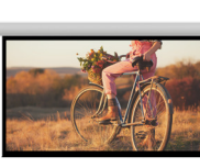
Matte White surface