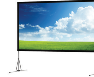
HD Rental surface