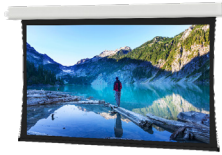
HD Progressive surfaces